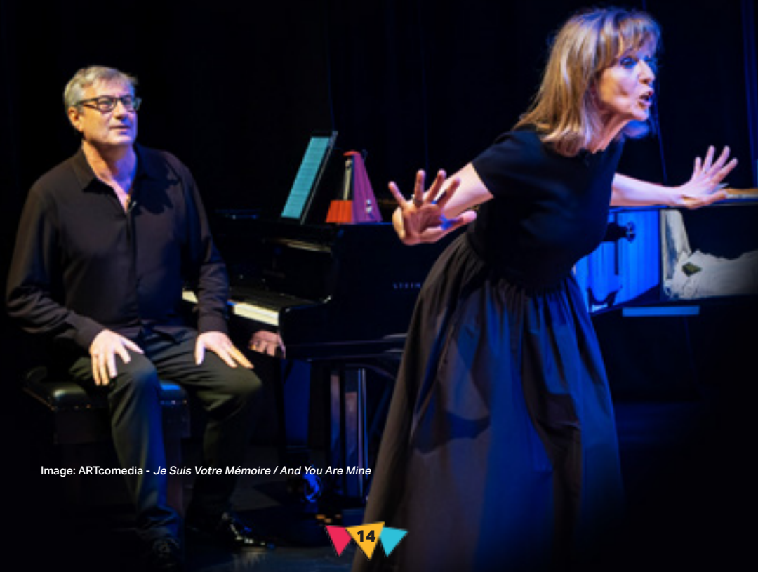
Je Suis Votre Mémoire / And You Are Mine