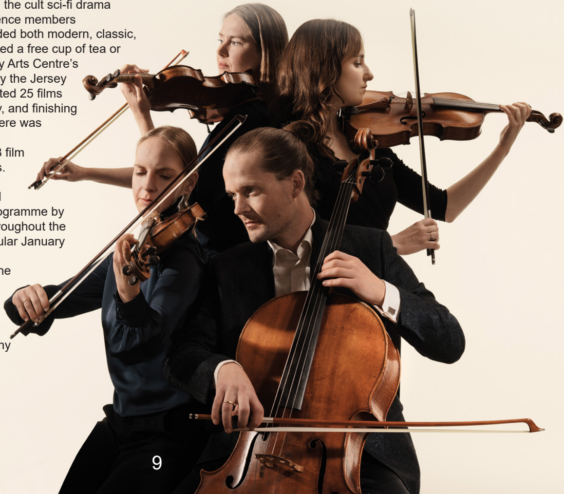
Image: Amici Artium - Dudok Quartet

Once again, Jersey Arts Centre would like to extend its thanks to all those engaged with its programme throughout 2024: those who visited the theatre, attended a course or workshop, watched a film, enjoyed an exhibition in the Berni Gallery, attended playdays Children's Festival or indeed joined us in the magical world of Charlie and the Chocolate Factory !