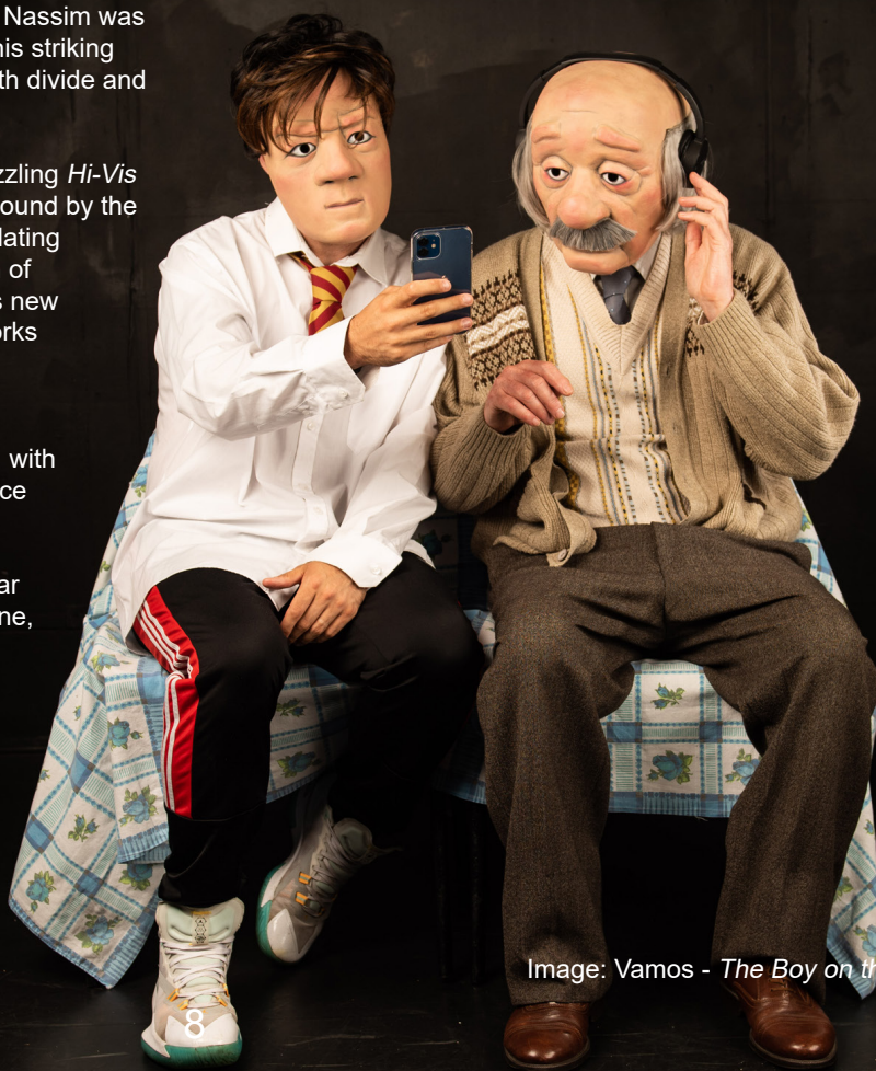
The Boy on the Roof