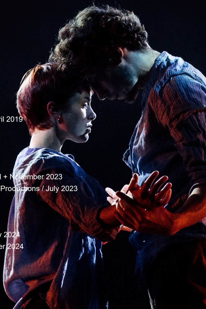
Image: Ballet d'Jèrri - Anniversaithe