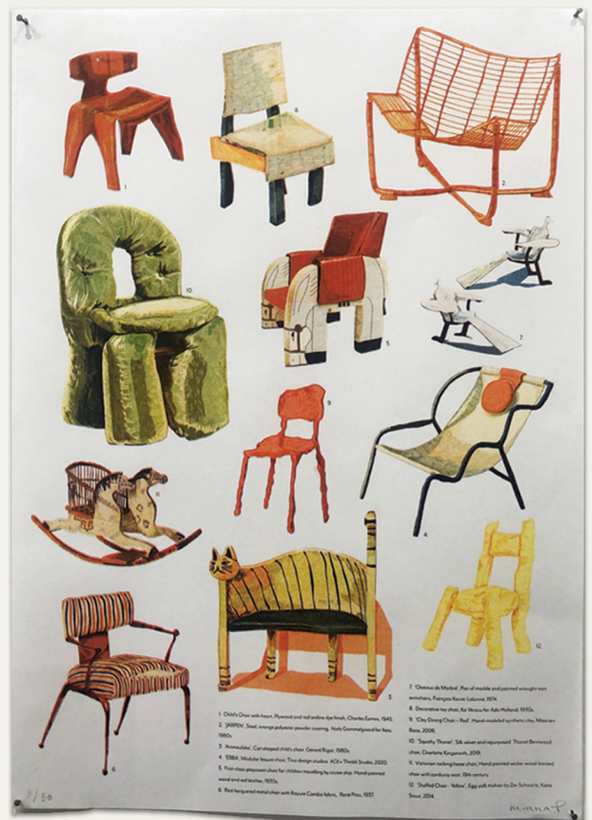
Image: The Original Student Art Exhibition : Detail from work by winner Minna Pemberton