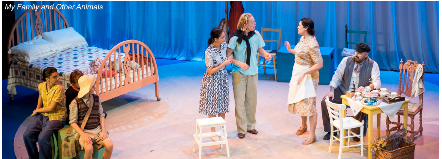
My Family and Other Animals