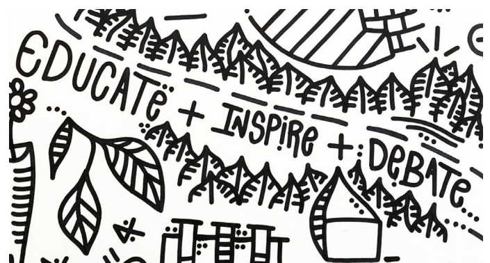
The Learning Centre Mural by Glen Fox

Jersey Arts Centre also hosted 7 Project Trident students during 2021.