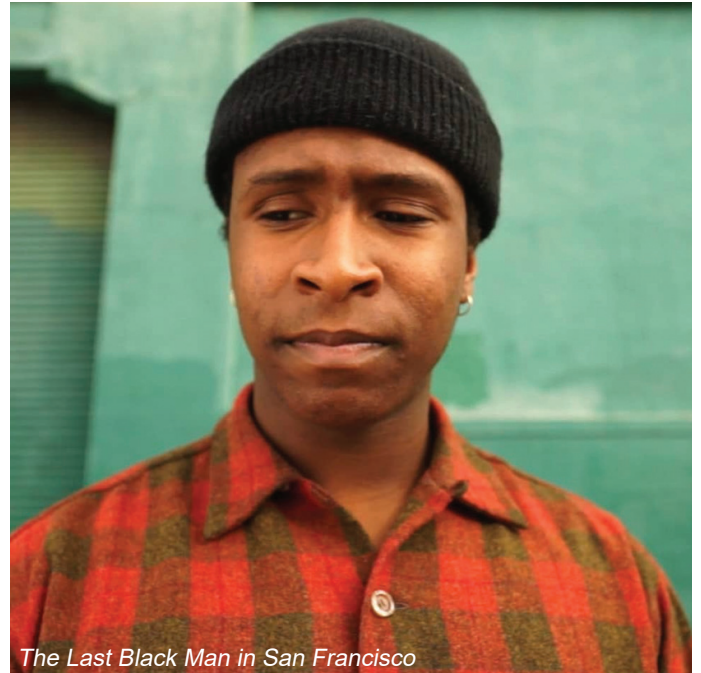
The Last Black Man in San Francisco