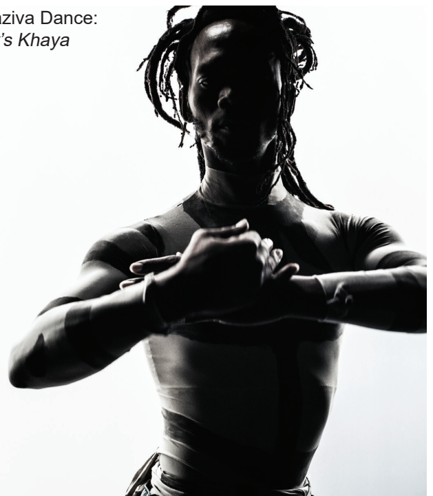
Tavaziva Dance: Boy's Khaya

Once again, Jersey Arts Centre would like to extend its thanks to all those who visited our venue, enjoyed an alfresco performance at Coronation Park, engaged with our online programme and supported our work throughout another extraordinary year.