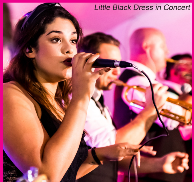
Little Black Dress in Concert